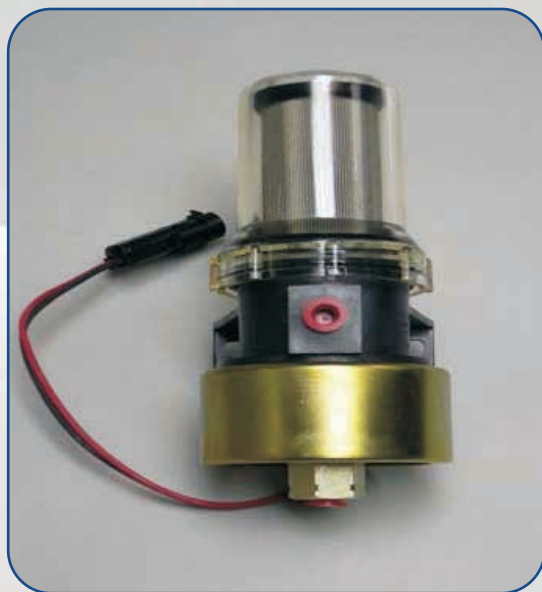
Fuel Pump Part No. 41-7059

Marshall Fleet Solutions latest promotional offer for 2010! Purchase 3 genuine Thermo King fuel pumps in one order and buy them for £100 (+ VAT) each!