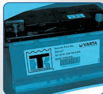
Truck Battery Part No. 203-0774 Trailer Battery Part No. 203-0765

A special price of only £95 (+ VAT) each will apply.